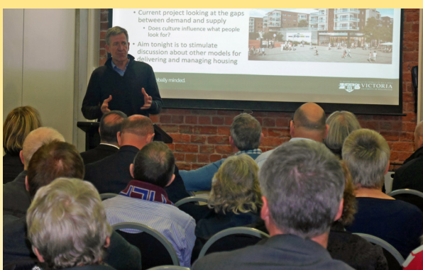
ICW Community Forum: Living Environments in Our City Tomorrow

ICW submitted to the Tax Working Group on its interim and final reports to reinforce the need to include residential owner-occupiers in any tax relief measures for seismic strengthening costs and to make it retrospective.