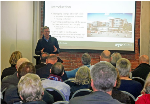
Engaging actively with the inner-city community

Your participation in any specific task would help us immensely. Committee membership is not a requirement to take on leadership or involvement in a particular task. However, it is important that the Committee is informed of actions and outcomes.